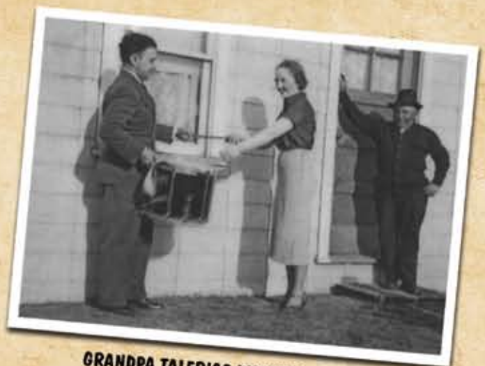
GRANDPA TALERICO WATCHES AS DAD GIVES MOM A DRUM LESSON -- 1939

succulent shrimp sautéed with fresh mushrooms and onions, flavored with marsala wine and our own spices, served over linguini 14.29