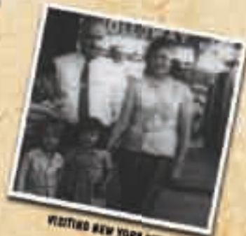
VISITING NEW YORK CITY 1968

giant gulf shrimp sautéed in white wine with fresh mushrooms, green peppers, onions and our spices over linguini 18.99